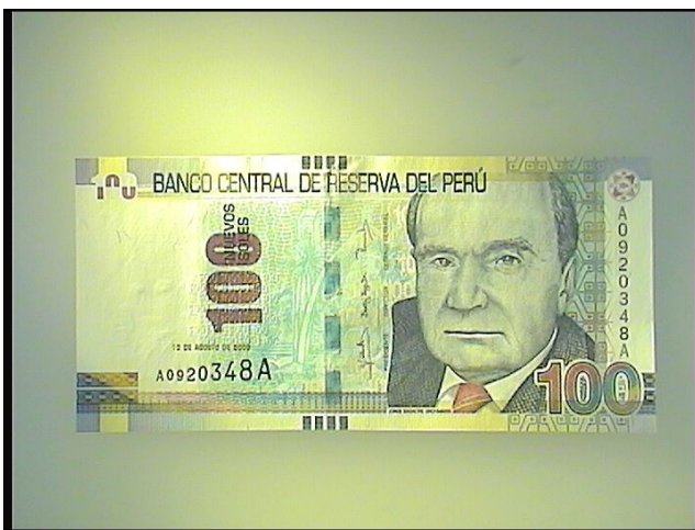
White oblique light