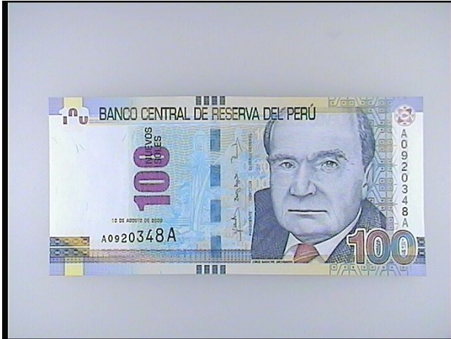
White top light