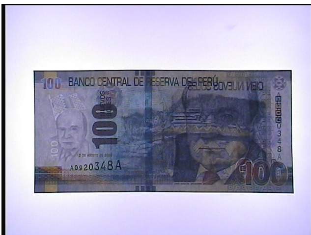
White bottom light