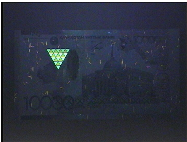
Ultraviolet top light (313 nm)