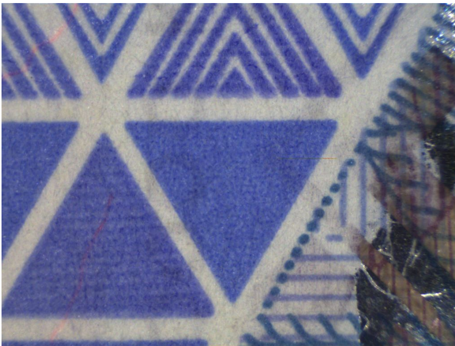
White top light 3x