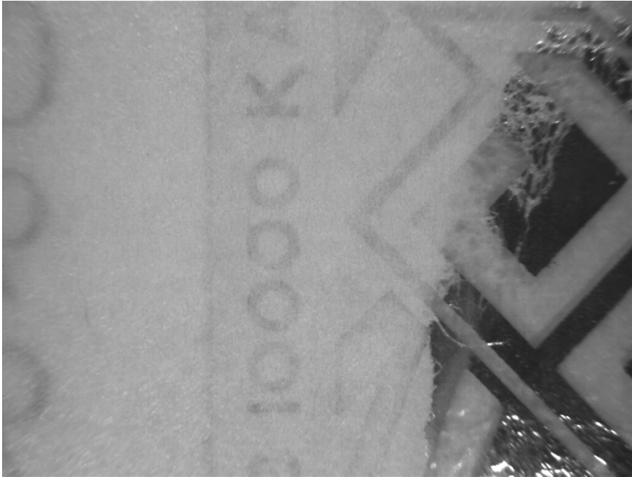
Infrared top light (940 nm) 1x