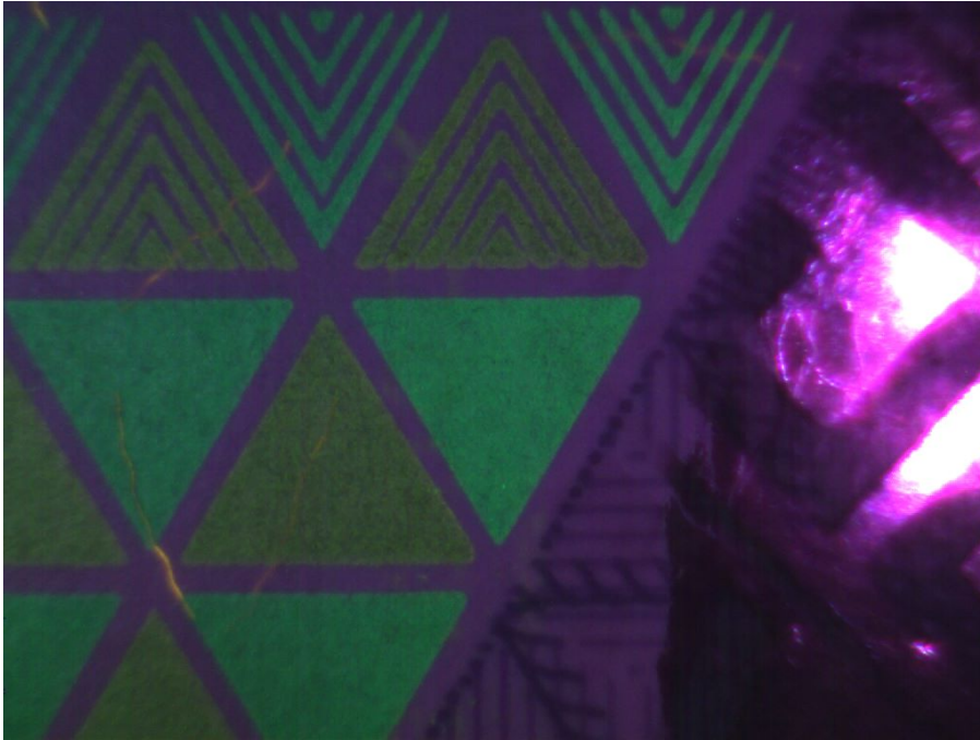
Ultraviolet top light (365 nm) 1x