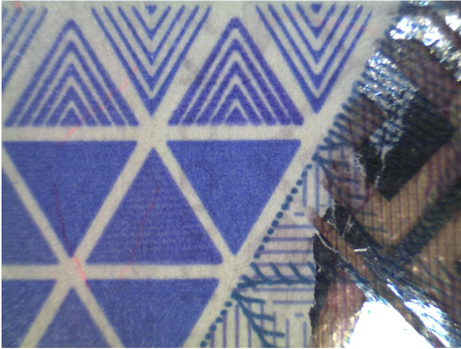
White top light 1x