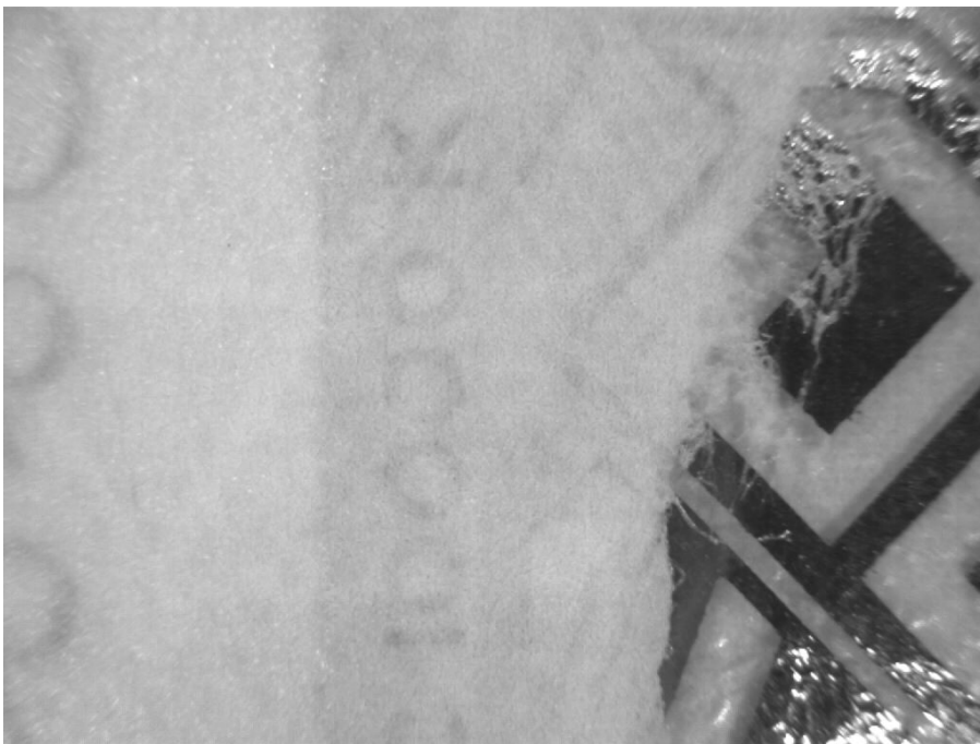
Infrared top light (870 nm) 1x