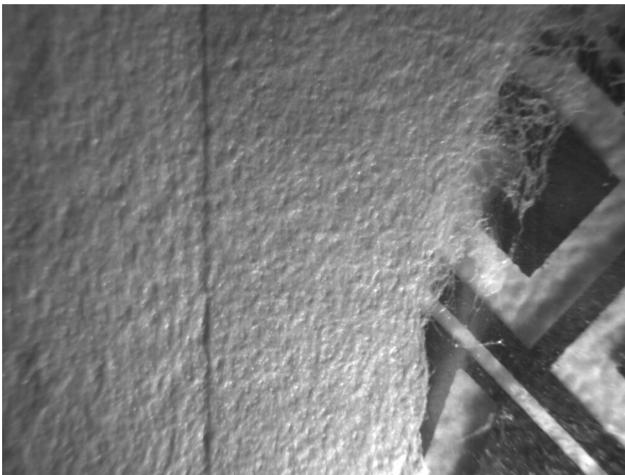
Infrared oblique light (880 nm) 1x