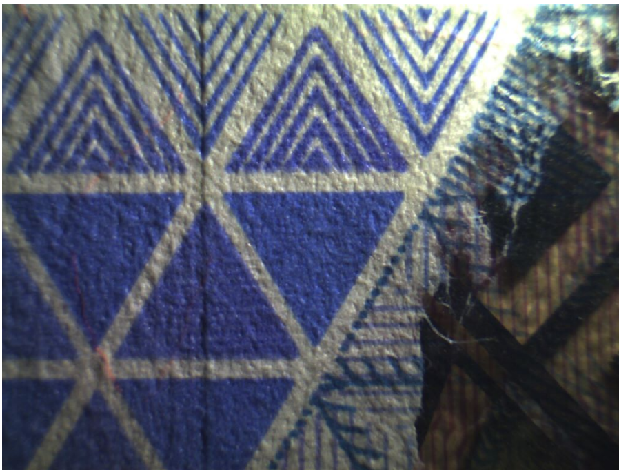
White oblique light 1x