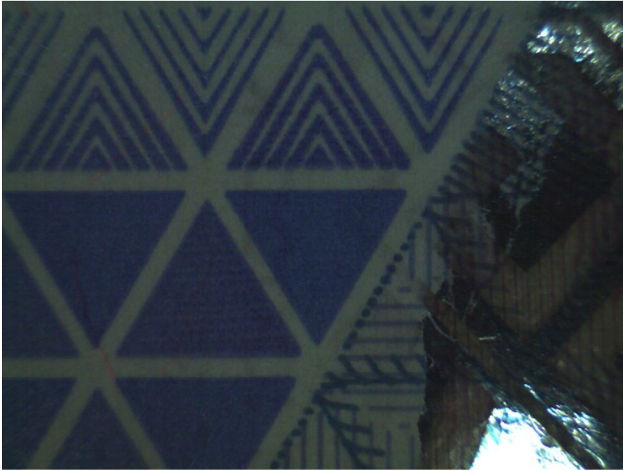
High-intensity Infrared light (980 nm) 1x