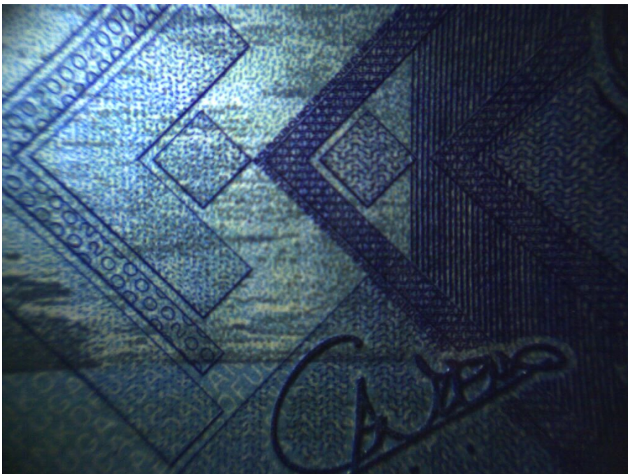
Oblique white light 1x