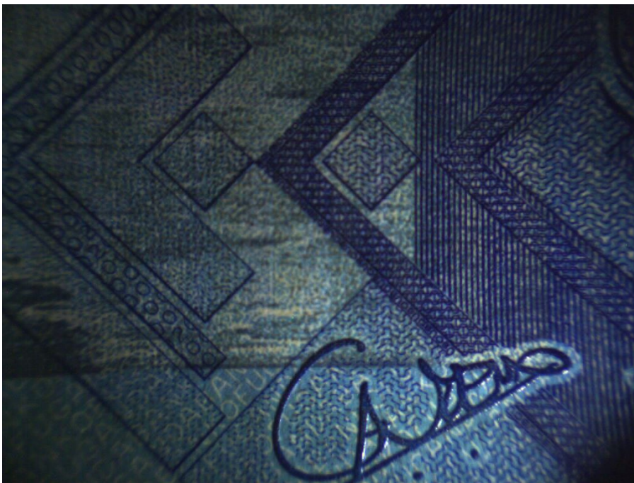
Oblique white light 1x