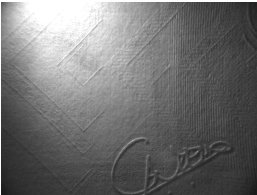
Oblique IR light 1x