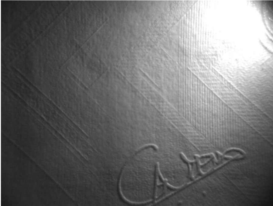
Oblique IR light 1x