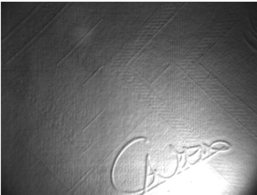
Oblique IR light 1x