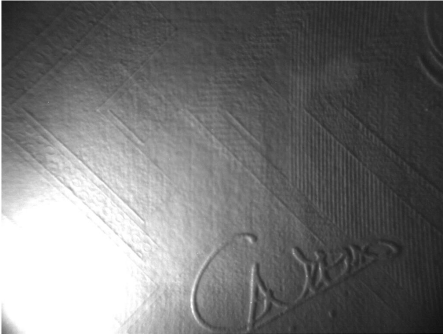
Oblique IR light 1x