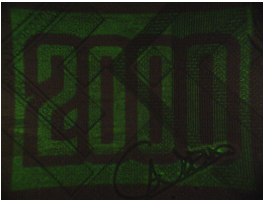
UV top light (254 nm) 1x