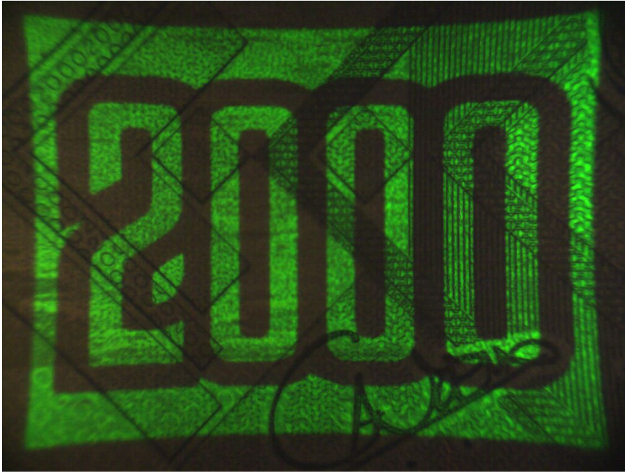
UV top light (313 nm) 1x