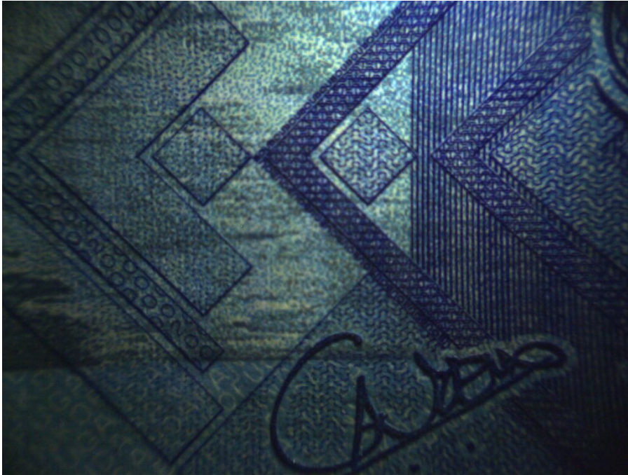
Oblique white light 1x