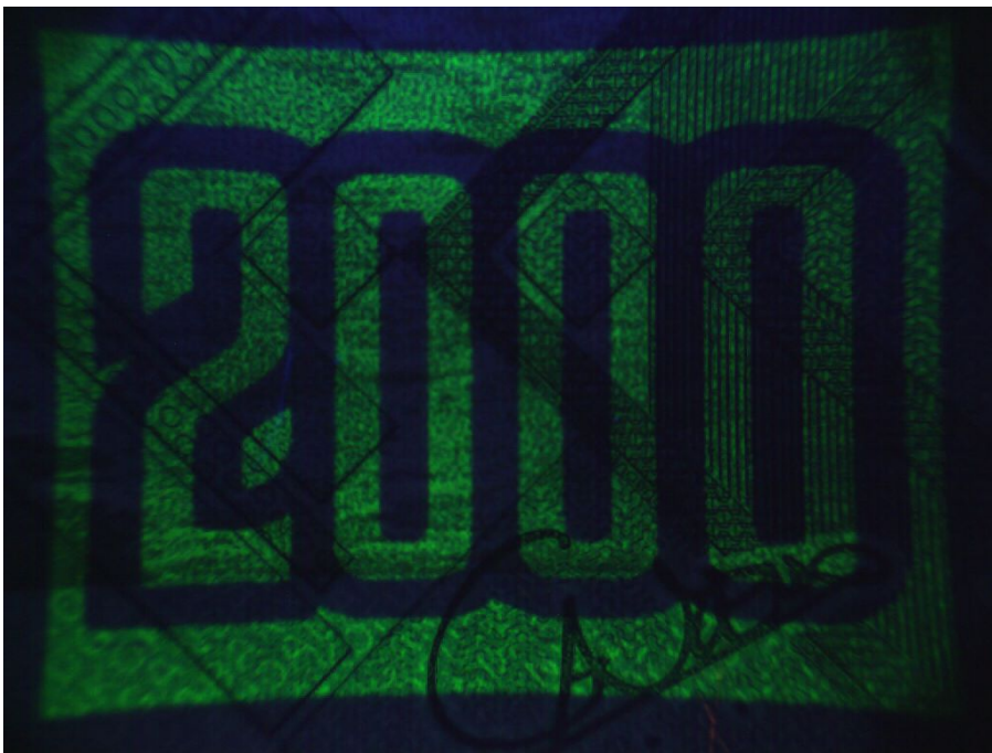
UV top light (365 nm) 1x