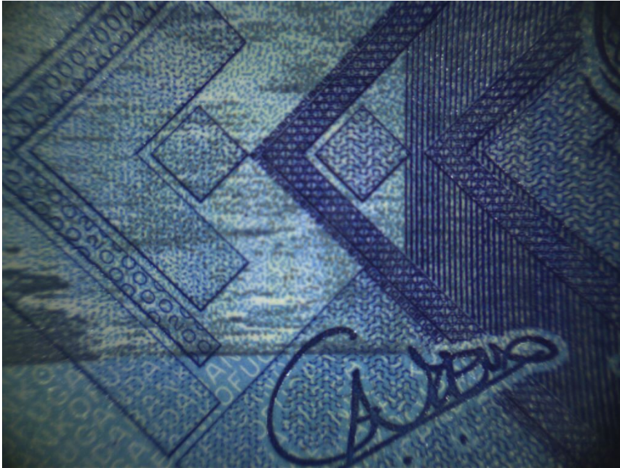
Top white light 1x